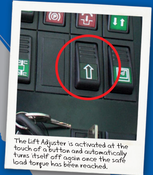
The Lift Adjuster is activated at the touch of a button and automatically turns itself off again once the safe load torque has been reached.

WORK SAFELY WITH YOUR CRANE – USE OUR LIFT ADJUSTER.